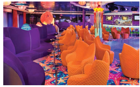
Medusa Lounge & Nightclub

This hip, high-energy club has great music, dancing and three private karaoke rooms. Seating capacity 85 (3,907 sq. ft.) (363 m²)