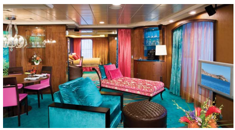
The Haven Owner's Suite with Large Balcony